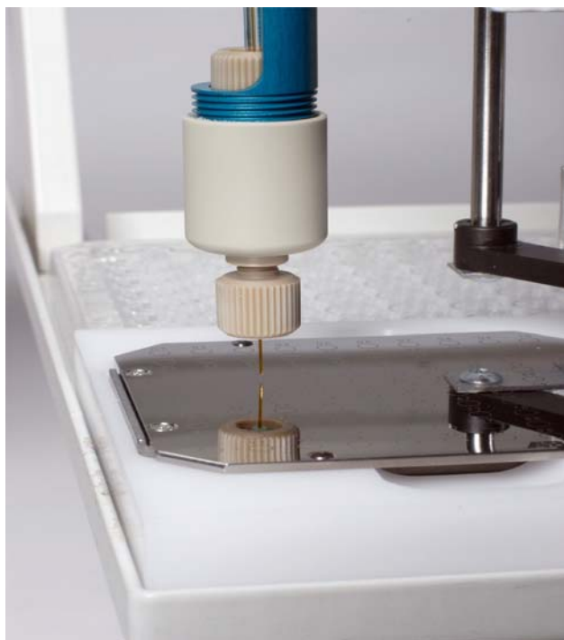
Nano Fractions to MALDI