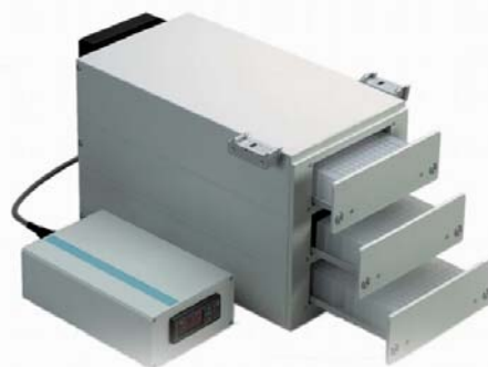
Digestion option (40 deg C) with optional extraction step